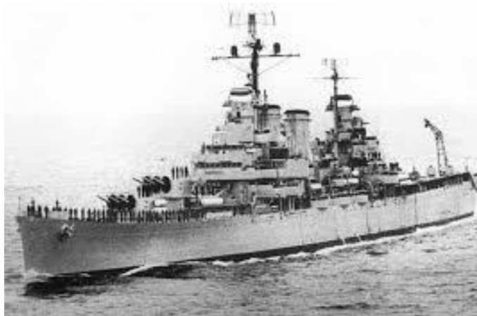
U.S. Naval ship – World War II