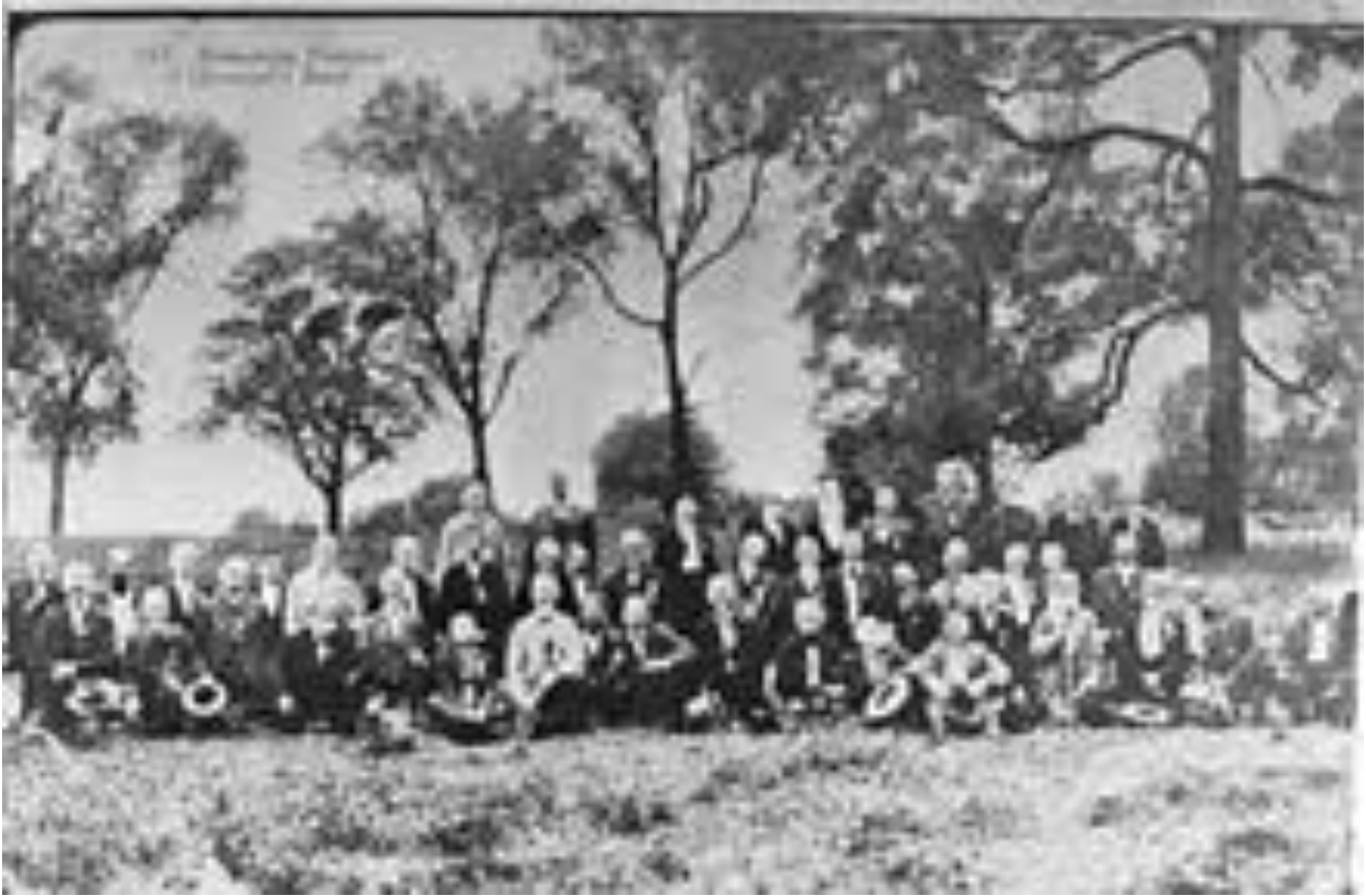
Reunion of Quantrell's Raiders